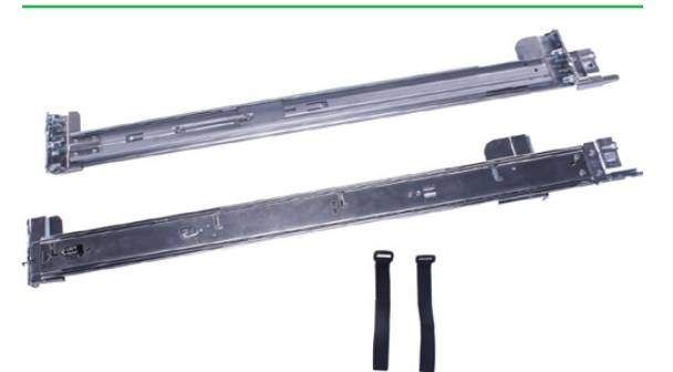
Mounting Kit (Mounting Brackets Shown)