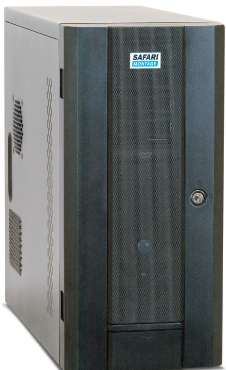
Tower Server T-420A (4 Bay)