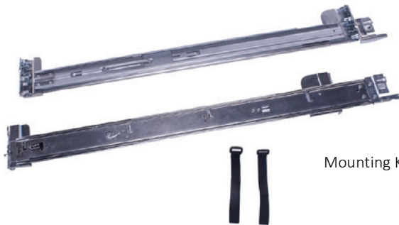
Mounting Kit (Mounting Brackets Shown)