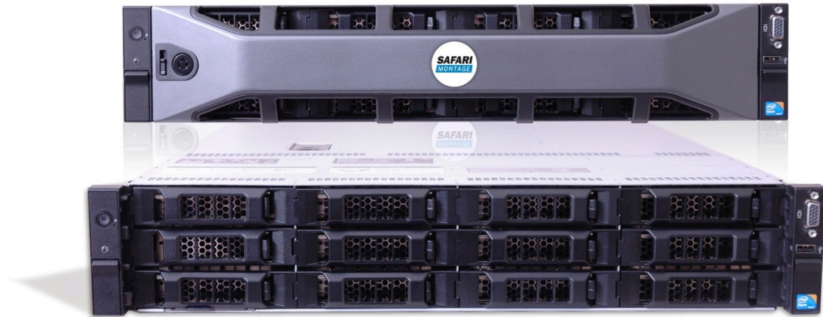
WAN-1216X, WAN-1212X, RM-128X, RM-126X

This setup guide covers the following SAFARI Montage server models: